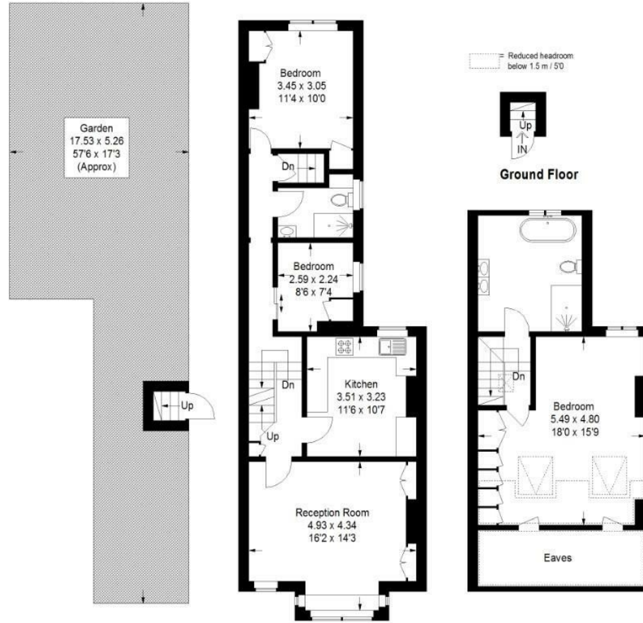
Ground Floor (Not Shown In Actual Location / Orientation)